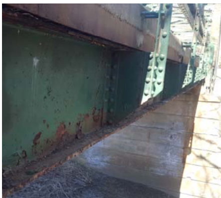
Deterioration of the Approach Span Beams

Detour Route: Traffic will be detoured during the bridge construction closure period. Traffic will be detoured utilizing state owned roads that will direct traffic to utilize VT 105 and VT 139 to the Richford-Abercorn border crossing in Richford, VT on VT 139.