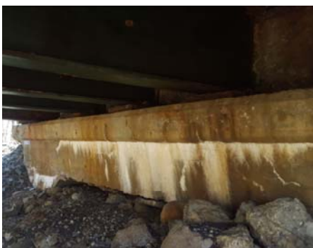
Poor Condition of Abutment #1